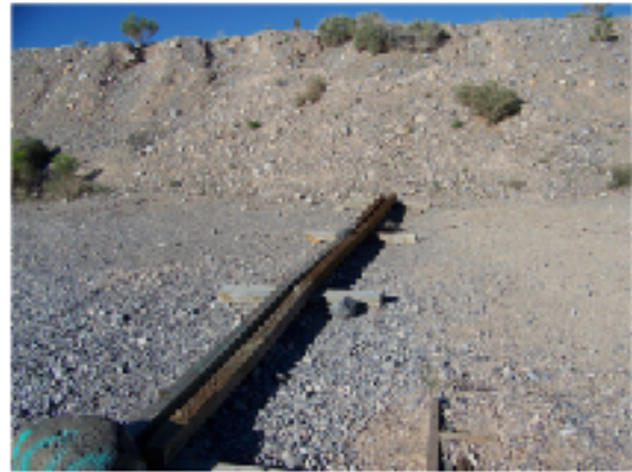
Range 5 -Target Slips